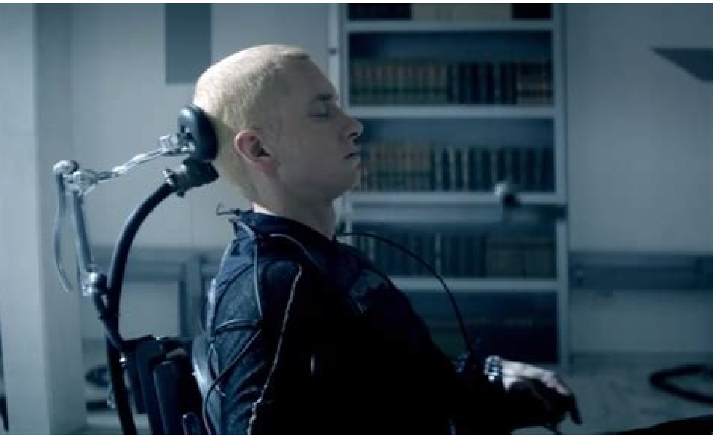
Eminem rap god song download mp4. Eminem song faster than rap god. Rap god eminem song download mr jatt. Eminem rap god song lyrics download. Is eminem godzilla the fastest rap song. Eminem song rap god. Eminem song rap god lyrics. Who is eminem dissing in rap god song.